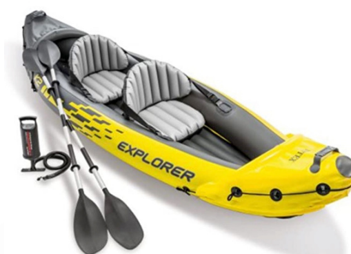
OUTDOOR ADVENTURE VALUE $360