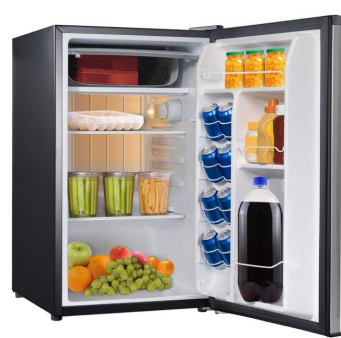
WHIRLPOOL MINI REFRIGERATOR VALUE $190