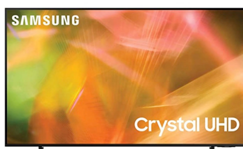
GRAND PRIZE SAMSUNG 50" SMART TV ALL DONORS HAVE A CHANCE TO WIN!

VIKING VOYAGE AUGUST 16TH - SEPTEMBER 30TH