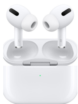
APPLE AIRPODS PRO VALUE $249