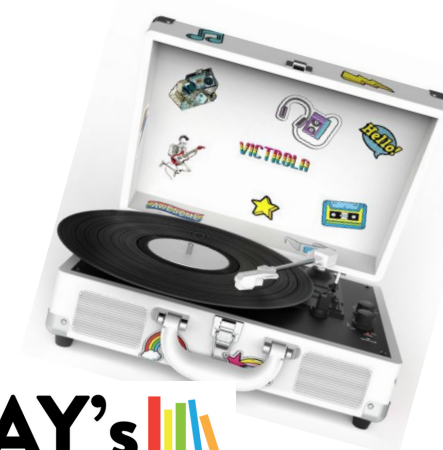
VICTROLA CANVAS RECORD PLAYER & ED MCKAY'S $100 GIFT CARD VALUE $160