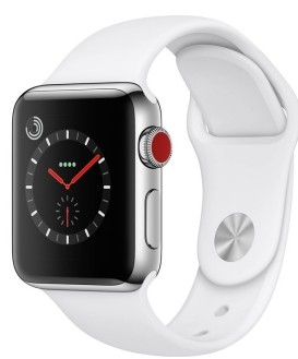
APPLE WATCH 42MM SERIES 3 VALUE $229